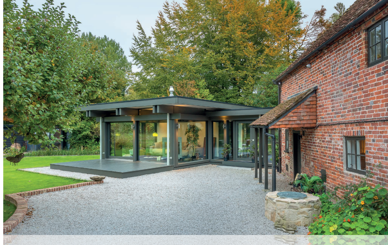
HUF HAUS Extension to brick building. ▲ Cover: Triple Garage and Office combination. ►